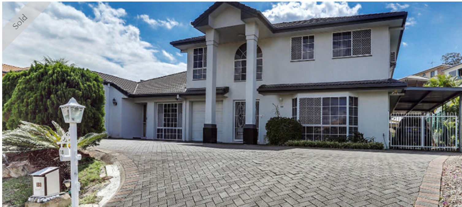
18 Mozart Place, Mount Ommaney