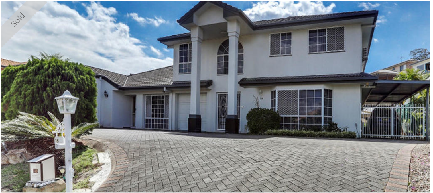
18 Mozart Place, Mount Ommaney