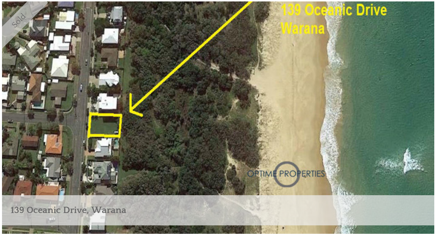
139 Oceanic Drive, Warana